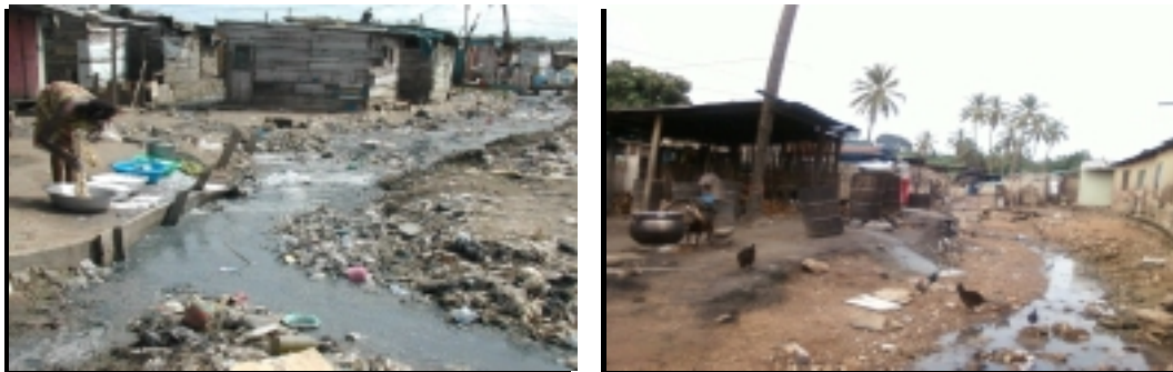
Plate 3: Liquid Waste Disposal in Slums

Drainage: From the study, it was evidenced that both communities had poor drainage systems as there were no proper drainage channels. As a result, liquid waste was disposed in the open space causing stagnation. The stagnation of the liquid waste serves as breeding places for mosquitoes. Furthermore, it was realised that the dwellers of both communities create trenches in the ground to enhance flow of liquid waste from their homes. Further analysis disclosed that the clustered nature of housing within these communities made it difficult and impossible for proper and safe drainage systems to be provided in the two communities.