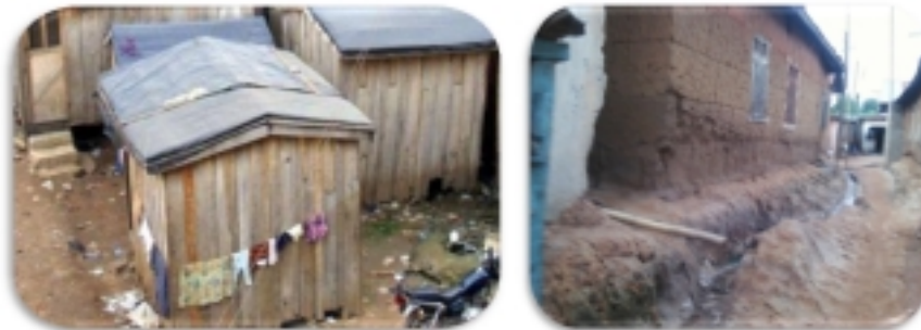
Plate 1: Nature and Condition of Housing Structure

buildings were wooden and the buildings had latex roofs. The condition of the remaining 5.1 per cent of the houses was average since they were made of concrete but had corroded roofing sheets with some having exposed foundations. The bad condition of the houses in the two communities could be attributed to lack of maintenance as well as fear of losing investments due to evictions. These evidences support the widely held literature that, housing condition, slum areas are dilapidated.