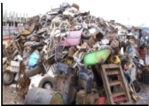
Plate 4: Metallic Waste Management

Management of Metallic Waste: The issue of waste management has been a bone of contention in most developing countries of which Ghana is no exception. Both solid and liquid waste management has been a major problem in the country since time immemorial. From the survey, it was realised that, Akwatia line is one of the communities that deal with scrap (metallic waste) metals.. There are scrap dealers in this community (averaging about 10.7 per cent of the enterprises in the community) who collect scrap from various suburbs of the metropolis and transform them into other objects which are useful to households and enterprises within and outside the metropolis. Amongst the products made from metallic waste by the scrap dealers in the community are coal pots, cooking pots and drums. This in the long run helps to minimise the improper disposal of metallic waste in the metropolis.